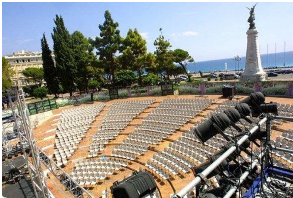
Théâtre de Verdure: Nice's iconic seaside amphitheater.